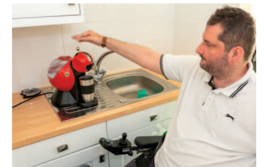
Promoting independent living