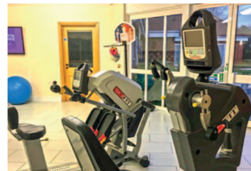
Well equipped gym