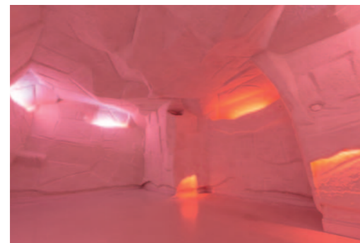
Sensory salt cave